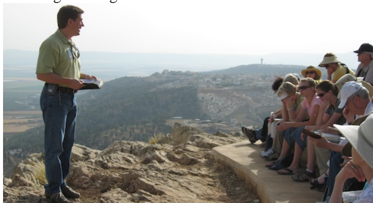
(Photo: Studying the life of Christ, overlooking the Jezreel Valley)

Don't Forget the Basics. Hopefully, you've thought of these. But just in case: